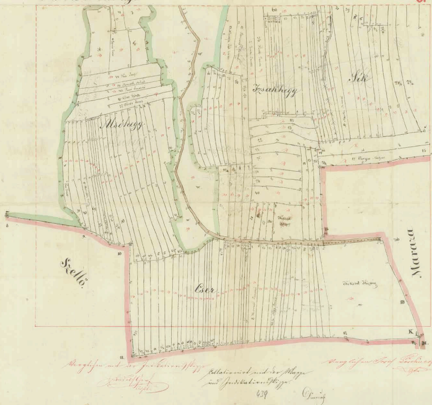
1. The 5. sheet of field sketch of the community Kékesd, 1865 (HU-MNL-OL S 79, N. 86/5).

croquis about the individual cadastral communities were produced in the 1850s, even at the beginning of the surveys. Later, in the 1870s, during the revision surveys Hungarian sketch maps were already constructed. The sketches mostly at a scale of 1:28800 represent the fields and their land use, and in the tables, belonging to the sketches, field names with their land use and area are given 2 .