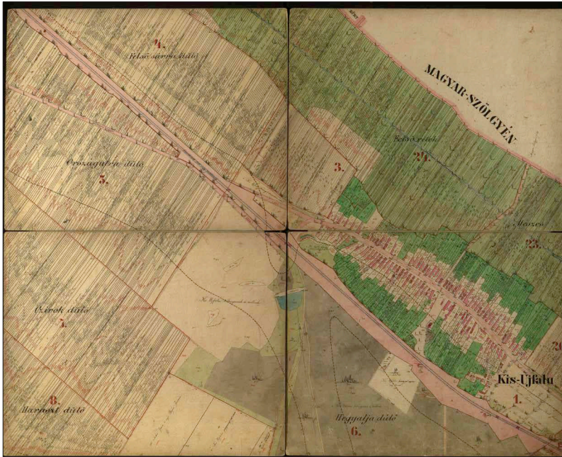
3. Detail of the indication sketches of the community Kisújfalu, 1888 (HU-MNL-OL S 78, Esztergom m. - Kisújfalu - 1-40).

in Budapest. The cadastral oleatas are prepress maps on oilpaper from the early 20 th century. Agriculture maps, small-scale (1:36000) county maps were compiled from cadastral maps for administrative purposes.