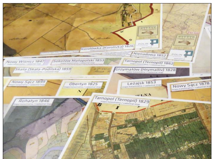
A small sampling of the maps from Gesher Galicia in the POLIN Museum's Resource Center.

The printed maps complement other learning aids available in the Resource Center for education, genealogy, and historical research. The Center is staffed by historians with expertise in a wide range of historical eras, locales, and themes. In addition to the maps, visitors have access to historical photographs of Jewish life in interwar Poland, computer databases devoted to the history and genealogy of Polish Jews, and a specialist library dedicated to the history, culture and religion of Jews of the region.